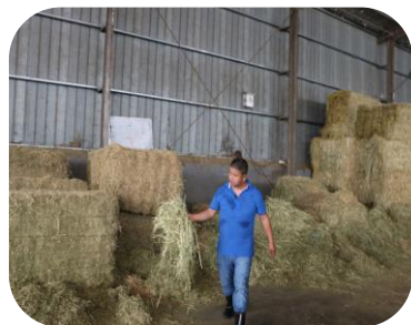
Integrated management of straw residue