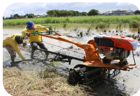
Asian and Pacific Network for Testing of Agricultural Machinery (ANTAM)