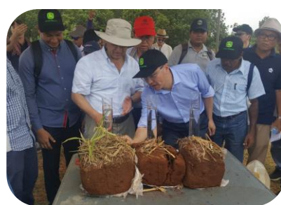
Research, data, publications, policy advisory services