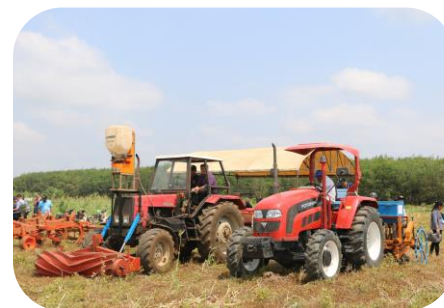
Regional Council of Agricultural Machinery Associations (ReCAMA)