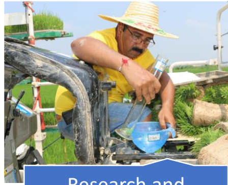
Research and Advisory