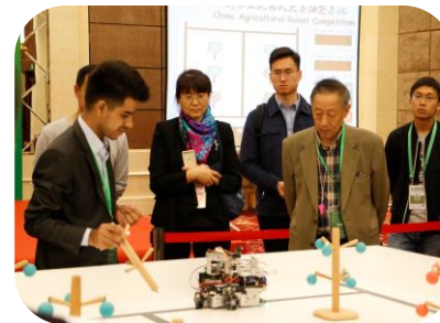
Engagement of youth