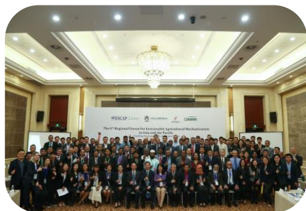
Regional Forum on Sustainable Agricultural Mechanization