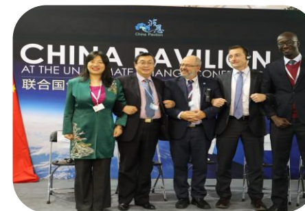
Building resilience of smallholder farmers through South-South Cooperation