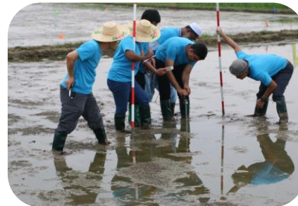
Training and institutional capacity building