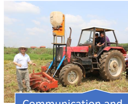
Communication and Outreach